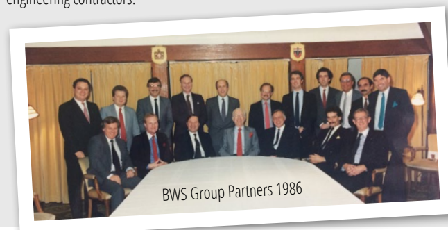
BWS Group Partners 1986