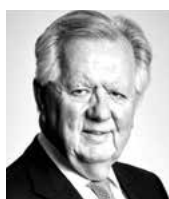
Steven Norris Non-Executive Chairman

Steven was a Member of Parliament from 1983 – 1997 serving as Parliamentary Private Secretary in the Departments of Environment, Trade and Industry, and the Home Office before becoming Minister for Transport in 1992. He is Chairman of Soho Estates and Senior Advisor to BNP Paribas Real Estate/Strutt & Parker. He is a member of the Board of Cubic Corporation Inc (NYSE: CUB) and Deputy Chairman of Optare plc. Steven is Chairman of the National Infrastructure Planning Association and a Commissioner of the Independent Transport Commission. He served on the Treasury's HS2 Growth Task Force and is an Honorary Fellow of the Association for Project Management, a Companion of the Institution of Civil Engineers, a Fellow of the Royal Institution of Chartered Surveyors and an Honorary Life Member of the Railway Civil Engineers Association.